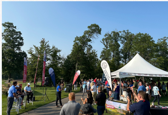
Brainerd Lakes Chamber 'Business After Hours' & Player Shootout on 17