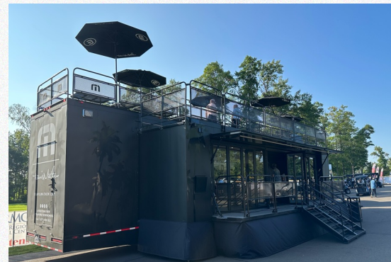
Northern Pacific Center Pro-Am featuring Travis Mathew Truck