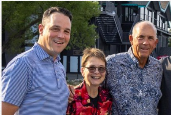
Cruising for Charity with Tom Lehman