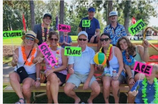
The ultimate fan experience