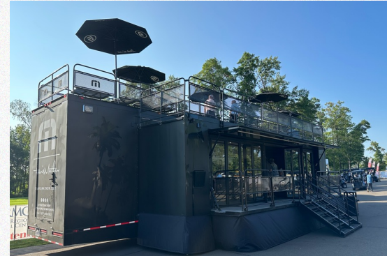
Northern Pacific Center Pro-Am featuring Travis Mathew Truck