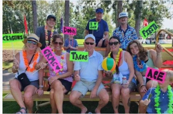
The ultimate fan experience