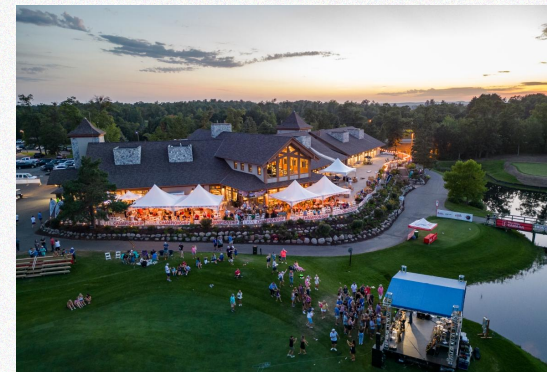
Clow Stamping Saturday Jam & Fireworks