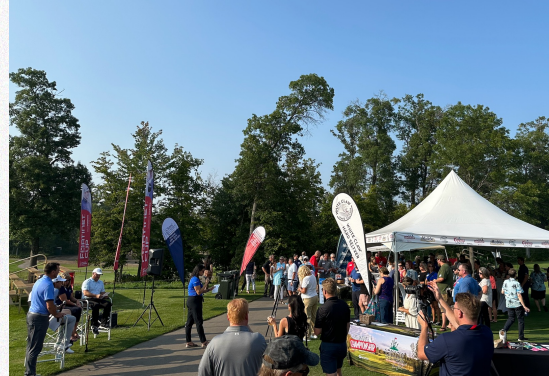
Brainerd Lakes Chamber 'Business After Hours' & Player Shootout on 17