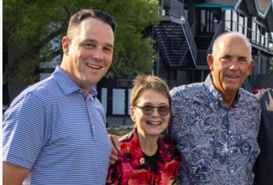
Cruising for Charity with Tom Lehman