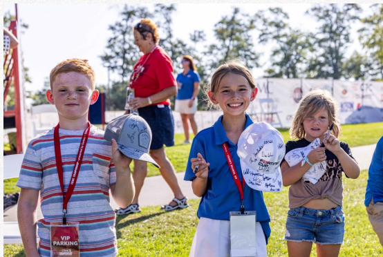
Take your Kid to the Course Day