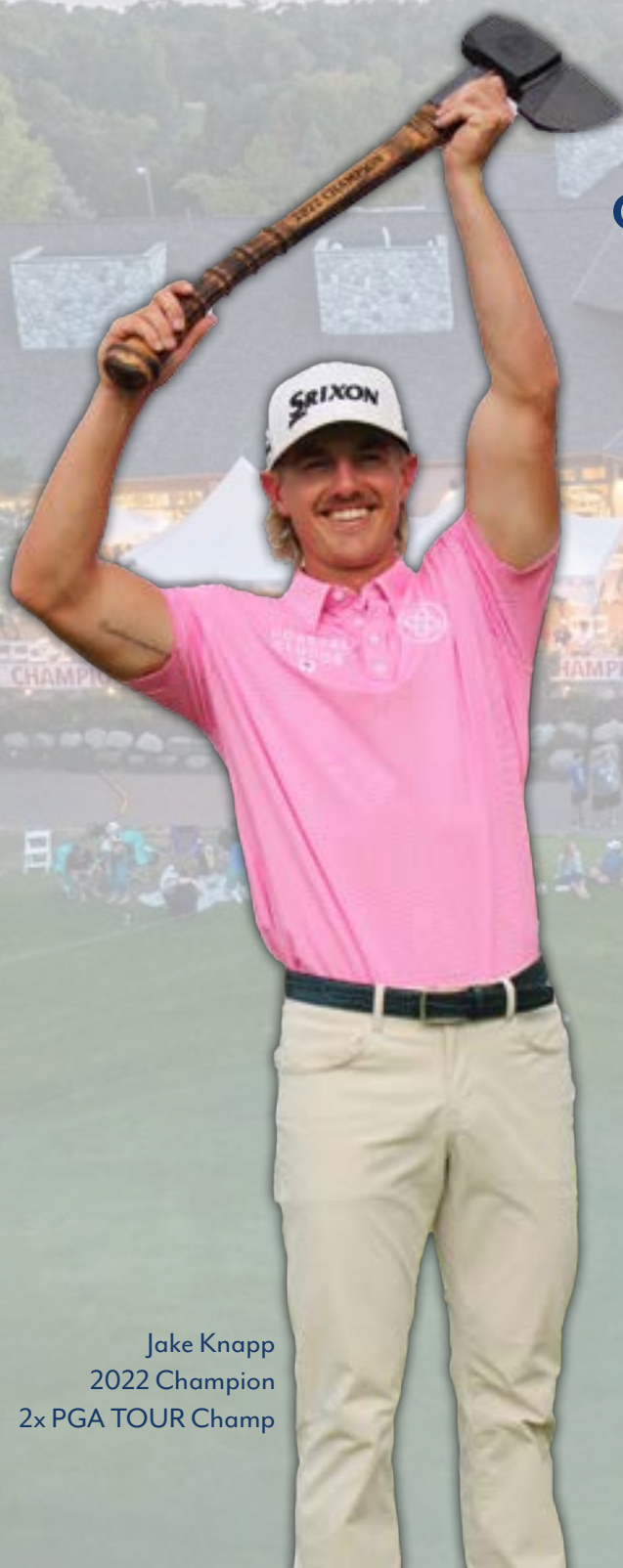
Jake Knapp 2022 Champion 2x PGA TOUR Champ