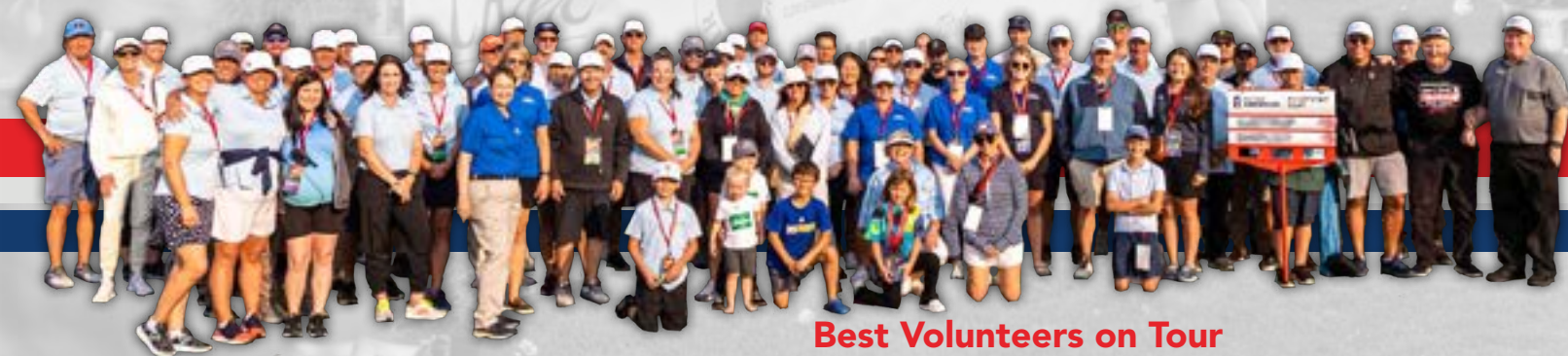
Best Volunteers on Tour