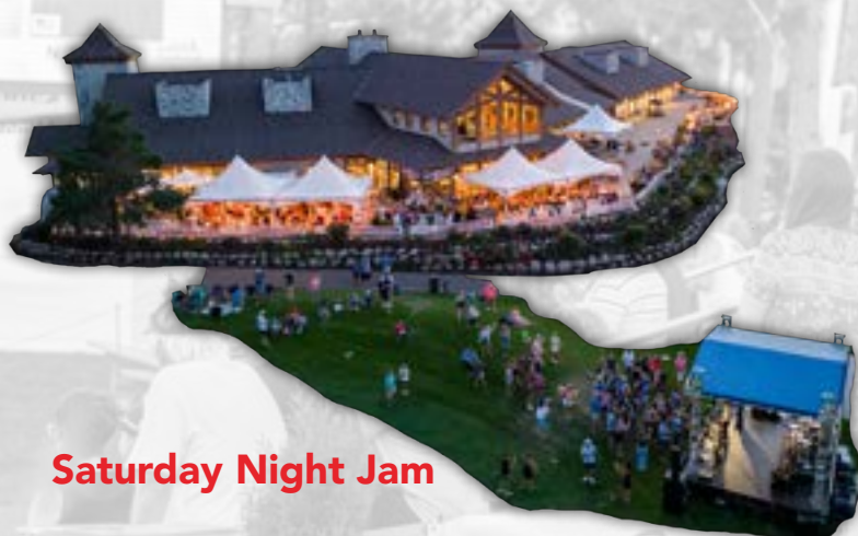
Saturday Night Jam