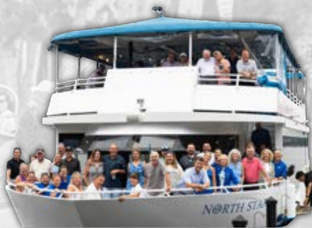
Cruising for Charity